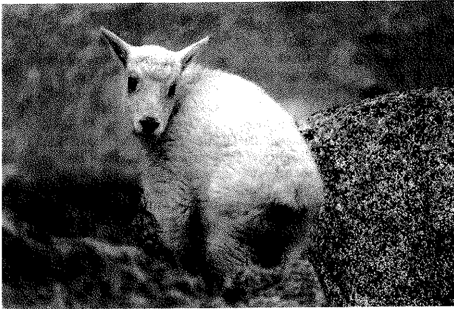
Sometimes the "cuteness" of juvenile wildlife prompts people to want to rescue/kidnap them. This young Mountain Goat does not need rescue.

may interfere with her ability to pinpoint the young's vocalizations). Consider the situation and whether anything happened to interfere with the reunion attempt. For example, if the neighbor lets his barking dog out on one side of the fence just as the mother is attempting to retrieve her young on the other side, the reunion may well be aborted.